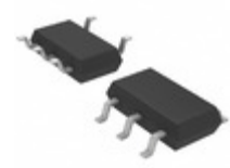
LTC2050CS5#TRMPBF Linear Technology IC OPAMP CHOPPER 3MHZ TSOT23-5