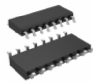
LTC203CS#TRPBF Linear Technology IC SWITCH QUAD SPST 16SOIC