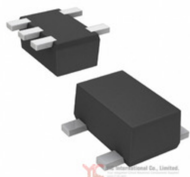
Image may be representation. See specs for product details.