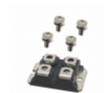
DHG50X600NA IXYS DIODE MODULE 600V 50A SOT227B