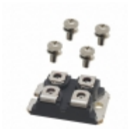
DHG50X1200NA IXYS DIODE MODULE 1.2KV 25A SOT227B