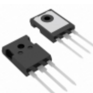
DHG60I1200HA IXYS DIODE GEN PURP 1.2KV 60A TO247AD