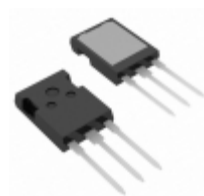
IXZR16N60 IXYS RF RF MOSFET N-CHANNEL PLUS247-3