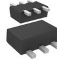
DMG564H20R Panasonic Electronic Components TRANS PREBIAS NPN/PNP SMINI6