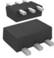
DMG564060R Panasonic Electronic Components TRANS PREBIAS NPN/PNP SMINI6