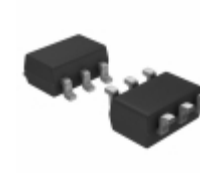
DMA204A00R Panasonic Electronic Components TRANS 2PNP 10V 0.5A MINI6