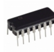
DAC8420FQ ADI (Analog Devices, Inc.) IC DAC 12BIT QUAD SRL LP 16- CDIP