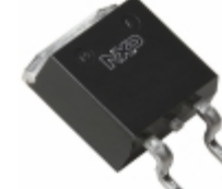
BTA316B-600E,118 WeEn Semiconductors TRIAC SENS GATE 600V 16A D2PAK