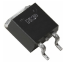
BTA316B-800C,118 WeEn Semiconductors TRIAC 800V 16A D2PAK