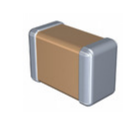
C1206C104M5RECAUTO7210 KEMET CAP CER 1206 0.1UF 50V X7R 20%