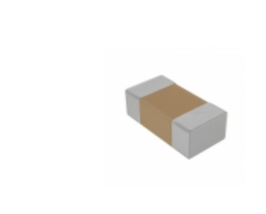
C1206C104M5RACTU KEMET CAP CER 0.1UF 50V X7R 1206