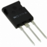
DSEP30-12CR IXYS DIODE GEN 1.2KV 30A ISOPLUS247