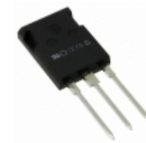
DSEP30-12AR IXYS DIODE GEN 1.2KV 30A ISOPLUS247