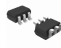
XP0611100L Panasonic Electronic Components TRANS PREBIAS DUAL PNP SMINI6