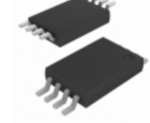
S-93L66AD01-T8T1G SII Semiconductor Corporation IC EEPROM 4KBIT 2MHZ 8TSSOP