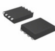
S-93L66AD01-I8T1U SII Semiconductor Corporation IC EEPROM 4K SPI 2MHZ SNT8A