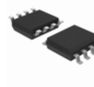
S-93L56AR01-J8T1G SII Semiconductor Corporation IC EEPROM 2KBIT 2MHZ 8SOP