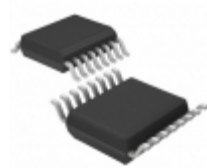
AD8604ARQZ-R7 Analog Devices Inc. IC OPAMP GP 8.4MHZ RRO 16QSOP