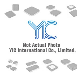
AD8604ARU-REEL AD AD8604ARU-REEL AD