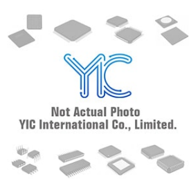
74ALVC125PW PHI 74ALVC125PW PHI