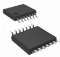
74ALVC132MTCX Fairchild/ON Semiconductor IC GATE NAND 4CH 2-INP 14-TSSOP