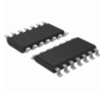
74ALVC132M Fairchild/ON Semiconductor IC GATE NAND 4CH 2-INP 14-SOIC