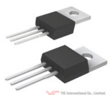
Image may be representation. See specs for product details.