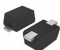
EDZTE613.3B Rohm Semiconductor DIODE ZENER 3.3V 150MW EMD2