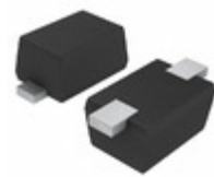
EDZTE6130B Rohm Semiconductor DIODE ZENER 30V 150MW EMD2