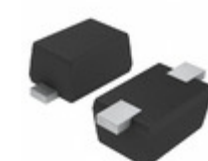
EDZTE6124B Rohm Semiconductor DIODE ZENER 24V 150MW EMD2