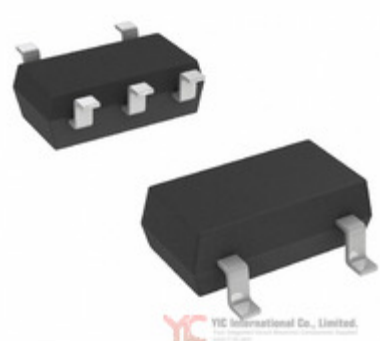
Image may be representation. See specs for product details.