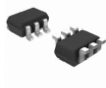
XP0NG8A00L Panasonic Electronic Components TRANS PREBIAS PNP 0.15W SMINI6