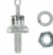
DSA9-16F IXYS DIODE AVALANCHE 1.6KV 11A DO203