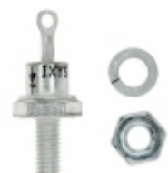
DSA9-12F IXYS DIODE AVALANCHE 1.2KV 11A DO203