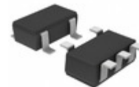
BD45295G-TR Rohm Semiconductor IC RESET OD 2.9V 50MS 5SSOP