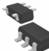
XC6122F736MR-G Torex Semiconductor Ltd. IC WATCHDOG TIMER SOT-25