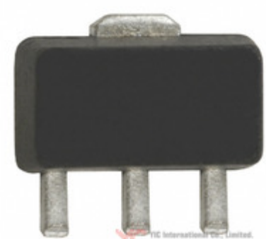
Image may be representation. See specs for product details.