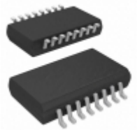
ADUM1300ARW ADI (Analog Devices, Inc.) DGTL ISO 2.5KV GEN PURP 16SOIC