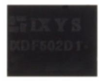
IXDF502D1T/R IXYS Corporation IC MOSF DRIVER FAST DUAL 6-DFN