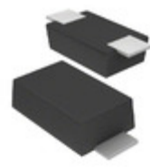
KDZLVTFTR82 Rohm Semiconductor DIODE ZENER 82V 1W SOD123FL