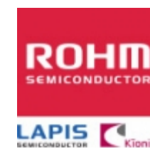
EDZVT2R13B/0402-13V ROHM EDZVT2R13B/0402-13V ROHM