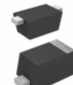
EDZVT2R15B Rohm Semiconductor DIODE ZENER 15V 150MW EMD2