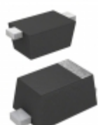
EDZVT2R16B Rohm Semiconductor DIODE ZENER 16V 150MW EMD2