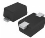
EDZVFHT2R5.6B LAPIS Semiconductor ZENER DIODES (CORRESPONDS TO AEC