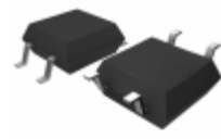
BU4838F-TR LAPIS Semiconductor IC VOLT DETECTOR STD 4-SOP