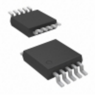
ADM489ABRMZ ADI (Analog Devices, Inc.) IC TXRX RS485/422 DIFF 10MSOP