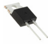
DSEP29-03A IXYS DIODE GEN PURP 300V 30A TO220AC