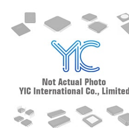
DSEP2*61-12A IXYS IGBT Modules