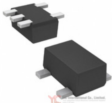
Image may be representation. See specs for product details.