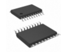
CY2DL1504ZXC Cypress Semiconductor Corp IC CLK BUFFER 2:4 1.5GHZ 20TSSOP