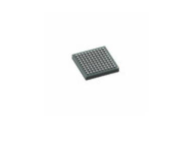
BCM54616SC0IFBG Avago Technologies (Broadcom Limited) SINGLE GBE SERDES PHY