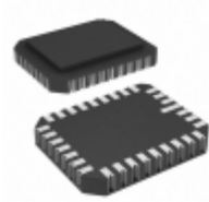
AT28C256F-15LM/883 Micrel / Microchip Technology IC EEPROM 256KBIT 150NS 32CLCC