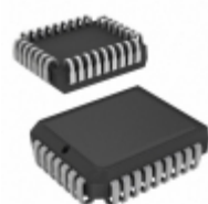
AT28C256F-15JI Micrel / Microchip Technology IC EEPROM 256KBIT 150NS 32PLCC