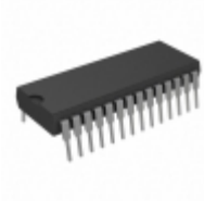
AT28C256F-15PC Micrel / Microchip Technology IC EEPROM 256KBIT 150NS 28DIP