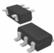
XC6121C319MR-G Torex Semiconductor Ltd. IC WATCHDOG TIMER SOT-25