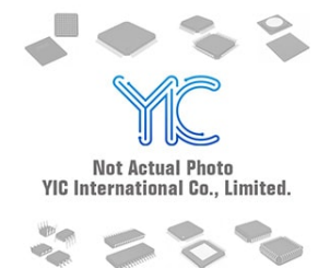
AD8564ARUZ+T ADI AD8564ARUZ+T ADI