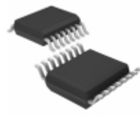
AD8564ARU-REEL ADI (Analog Devices, Inc.) IC COMP QUAD 7NS FAST 16- TSSOP