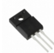
DSA20C100PN IXYS DIODE ARRAY SCHOTTKY 100V TO220F