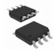
ACSL-6210-56RE Avago Technologies (Broadcom Limited) OPTOISO 2.5KV 2CH OPEN COLL 8SO