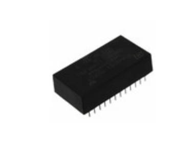
M48T12-200PC1 STMicroelectronics IC RTC CLK/CALENDAR PAR 24DIP