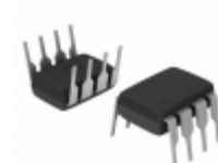
LT1012AIN8#PBF Linear Technology IC OPAMP GP 8DIP