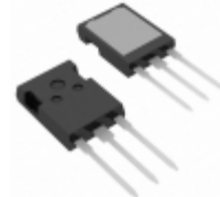
IXZR08N120 IXYS RF RF MOSFET N-CHANNEL PLUS247-3