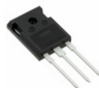
IXZH10N50L2A IXYS RF RF MOSFET N-CHANNEL TO-247