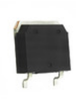
DSEP60-06AT IXYS DIODE GEN PURP 600V 60A TO268AA