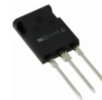
DSEP75-06AR IXYS DIODE GEN 600V 75A ISOPLUS247