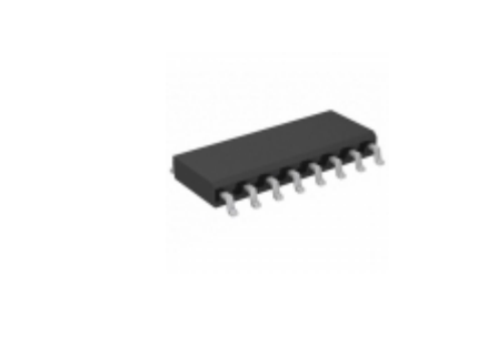
SP691AEN-L/TR Exar Corporation IC SUPERVISOR MPU LP 16SOIC