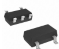
DMA2610H0R Panasonic Electronic Components TRANS PREBIAS DUAL PNP MINI5