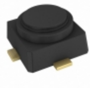
CE3520K3 CEL RF FET 4V 20GHZ 4MICROX