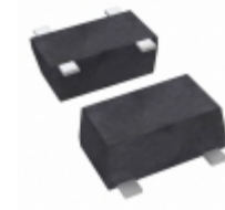
CE3514M4 CEL RF FET 4V 12GHZ SOT343