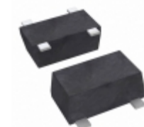
CE3521M4 CEL RF FET 4V 20GHZ SOT343