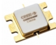
CGHV35400F Cree Wolfspeed RF MOSFET HEMT 45V 440210