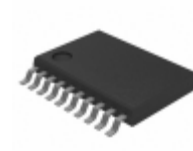
CGHV35060MP Cree Wolfspeed RF MOSFET HEMT 50V 20TSSOP