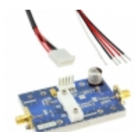
CGHV40030-TB Cree/Wolfspeed TEST FIXTURE FOR CGHV40030F