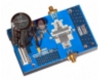
CGHV35150-TB Cree Wolfspeed TEST FIXTURE FOR CGHV35150F