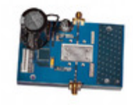
CGHV35400F-TB Cree Wolfspeed TEST FIXTURE FOR CGHV35400F