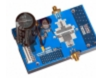
CGHV35150-TB Cree/Wolfspeed TEST FIXTURE FOR CGHV35150F