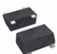
CE3521M4-C2 CEL RF FET 4V 20GHZ SOT343