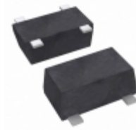
CE3521M4 CEL RF FET 4V 20GHZ SOT343