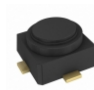
CE3512K2-C1 CEL RF FET 4V 12GHZ 4MICROX