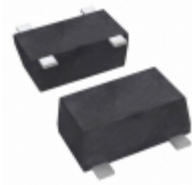
CE3514M4-C2 CEL RF MOSFET PHEMT FET 2V SOT343