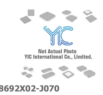
S1M8692X02-J070 SAMSUNG SAMSUNG QFN