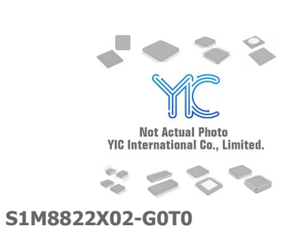
SAMSUNG SAMSUNG QFN-18