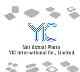
ADM809RART-REEL7 AD ADM809RART-REEL7 AD