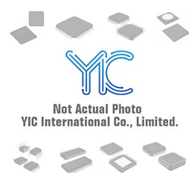
ADM809RART-RL7 AD ADM809RART-RL7 AD