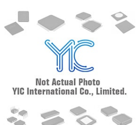
ADM809RARTZ ADI ADM809RARTZ ADI