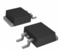
NTB45N06LT4G ON Semiconductor MOSFET N-CH 60V 45A D2PAK