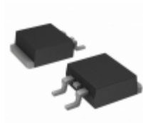
NTB4302G ON Semiconductor MOSFET N-CH 30V 74A D2PAK