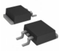
NTB35N15T4G ON Semiconductor MOSFET N-CH 150V 37A D2PAK