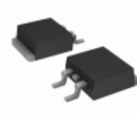
NTB4302 ON Semiconductor MOSFET N-CH 30V 74A D2PAK