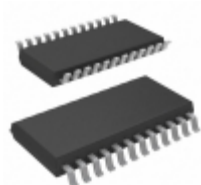
LT5500EGN#PBF Linear Technology IC RECEIVER FRONT END 24- SSOP