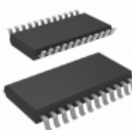
LT5500EGN Linear Technology IC RECEIVER FRONT END 24- SSOP