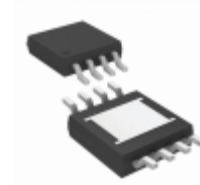
LT5400BMPMS8E-8#TRPBF Linear Technology RES ARRAY 4 RES MULT OHM 8TSSOP