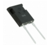
DSEP30-06BR IXYS DIODE GEN 600V 30A ISOPLUS247