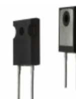
DSEP30-03A IXYS DIODE GEN PURP 300V 30A TO247AD