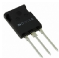
DSEP30-06CR IXYS DIODE GEN 600V 30A ISOPLUS247